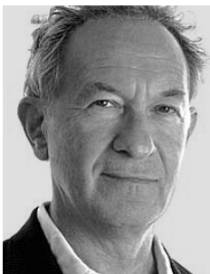
Simon Schama, Ph.D.

Johnstone Family Professor of Psychology Harvard University