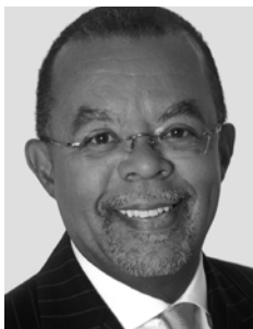
Henry Louis Gates Jr., Ph.D.

An independent panel of internationally respected jurors selects the Anisfield-Wolf winners. The current jury is chaired by Henry Louis Gates Jr. and includes Rita Dove, Joyce Carol Oates, Steven Pinker and Simon Schama.