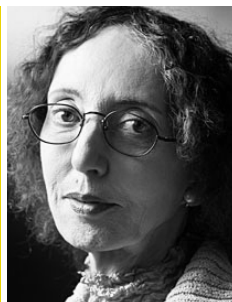
Joyce Carol Oates

Commonwealth Professor of English University of Virginia