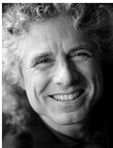
Steven Pinker, Ph.D.