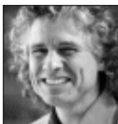
Steven Pinker, Ph.D.

Roger S. Berlind '52 Professor in the Humanities Princeton University