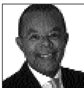
Henry Louis Gates Jr.

An independent panel of nationally known jurors selects the Anisfield-Wolf winners. The current jury is chaired by Dr. Henry Louis Gates Jr. and includes Rita Dove, Joyce Carol Oates, Steven Pinker, and Simon Schama.