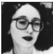
Joyce Carol Oates

Commonwealth Professor of English University of Virginia